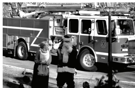
Mr. & Mrs. Claus arrive at the 2008 Gingerbread Open House with the help of the Mountainside Fire Department.