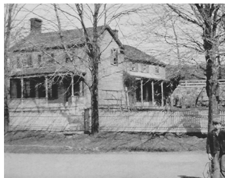
Photo of the Levi Cory House as it looked after the turn of the 20th Century. The Committee aims to restore the house to this look.

Further down the road, the house will need to be connected to utilities such as electric, water and sewer so that it can be opened to the public as a museum for Childrens' interests.