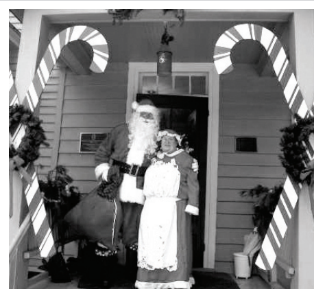
Mr. & Mrs. Claus welcome visitors to the 2007 Hetfield House's Gingerbread Open House.