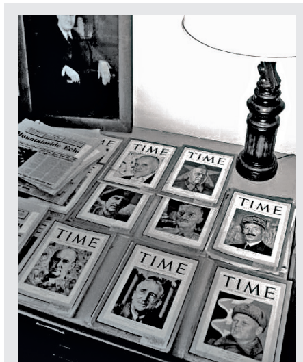
A table in the Hetfield House's "Veterans' Room" displays wartime magazines.