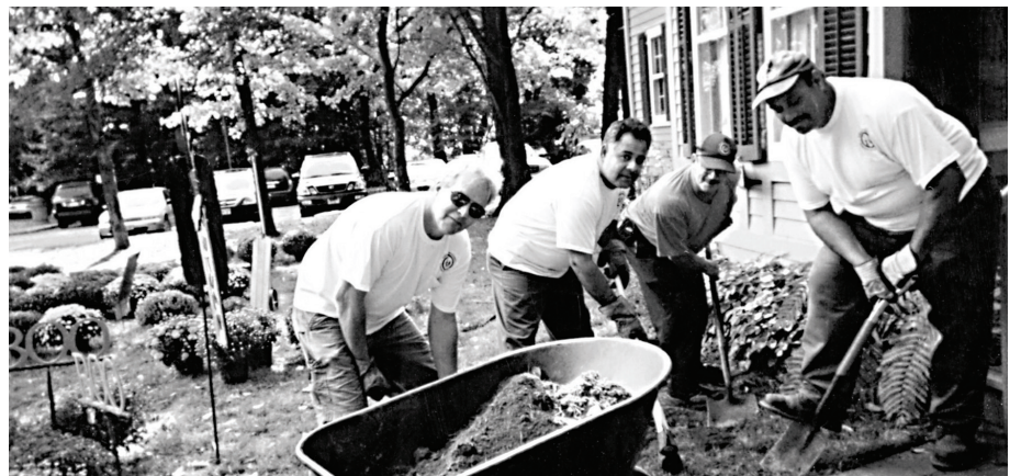
PLANTING SUNSHINE! At the front entrance to the Hetfield House, members of the Mountainside Department of Public Works help to plant 100's of daffodil bulbs donated by the Rake & Hoe Garden Club.