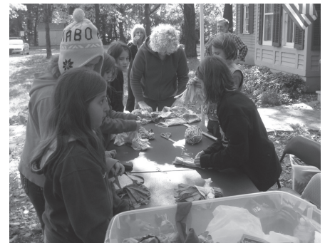
On Saturday, October 15, Mountainside Girl Scouts helped visitors make colonial rag dolls and play colonial games.