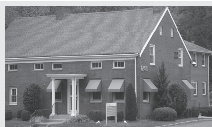
Smith Williams house as it stands today - a more modern-looking structure which shares the parking lot near Arirang Restaurant on Route 22 West

The Mountainside Restoration Committee and the Mountainside Historic Preservation Committee were established to preserve the Borough's links to the past. The premier venue is the Deacon Andrew Hetfield House, our circa 1760 building, preserved by these two committees whose volunteers share membership. We strive to focus attention on our heritage through tours, newsletters, videos and many events during the year. Our mission includes maintaining the Hetfield House property in perpetuity.