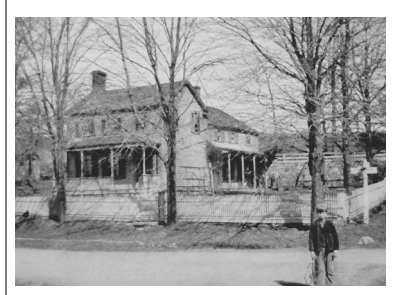
Bird's Corner, 2 New Providence Road. Now, the Levi Cory House moved to Constitution Plaza.