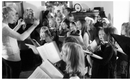
During the Family Gingerbread Open House, Our Lady of Lourdes Parish Children's Choir sings at the Hetfield House.

December 11 – Family Gingerbread Open House (1-4pm)